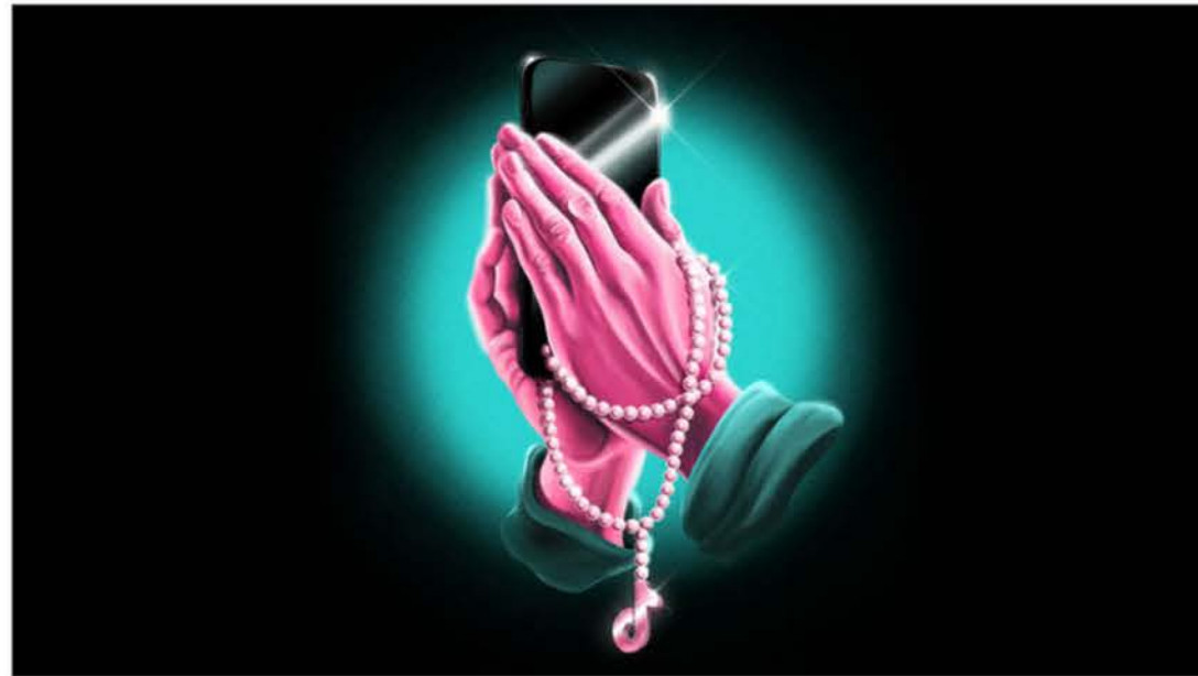
ILLUSTRATION: ERIC THOMPSON

Social media are changing people's faith in unexpected ways